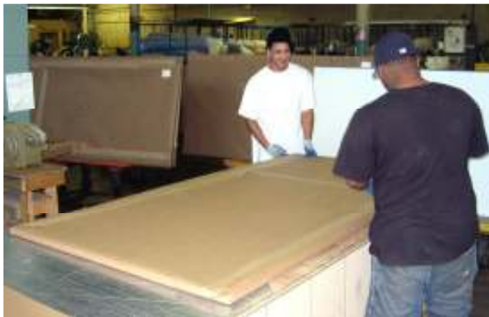
Small chalkboard packaging