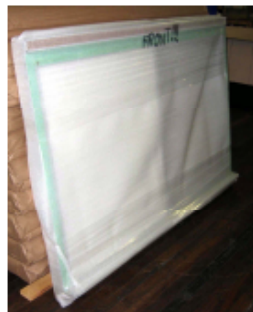
Two board slider packaging