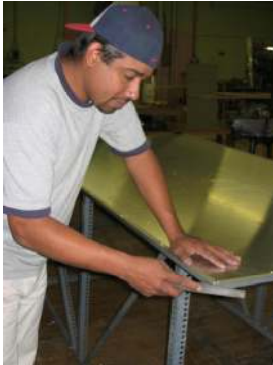
Shown: J Series Frame

Boards are inspected and all sharp edges are filed smooth. Shown: Big Apple Frame