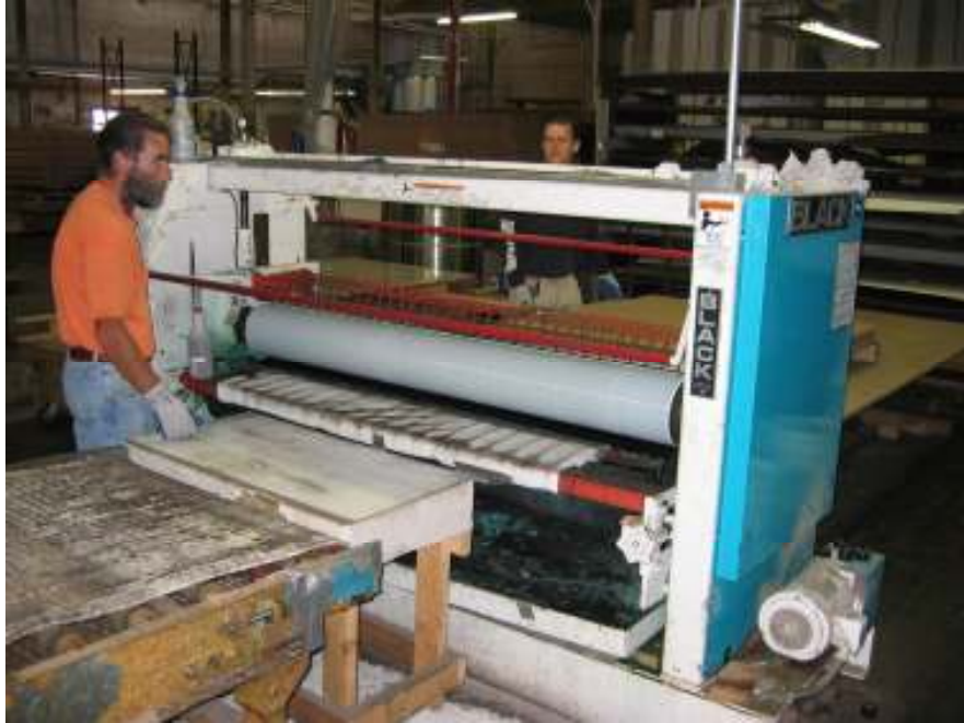
Adhesive is applied to the facing and core

Manufacturers of Custom Quality Chalk Boards, Marker Boards, Bulletin Boards and Display Cases