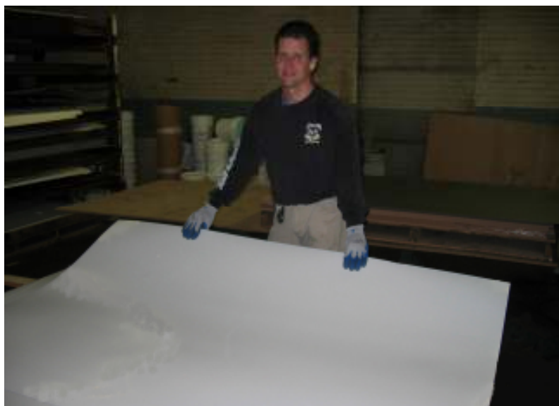
Porcelain steel is cut to size