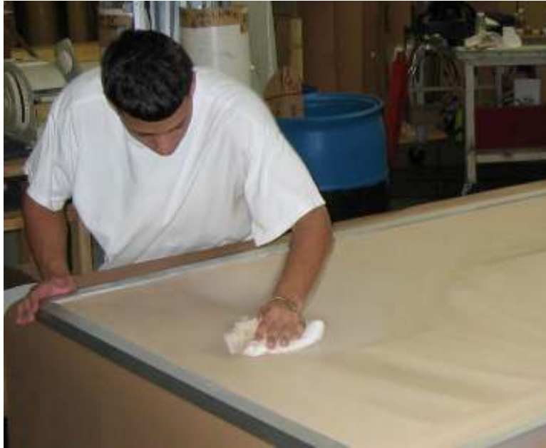
Each product is inspected and cleaned before packing. Shown: Big Apple frame with Forbo color 2187

Manufacturers of Custom Quality Chalk Boards, Marker Boards, Bulletin Boards and Display Cases