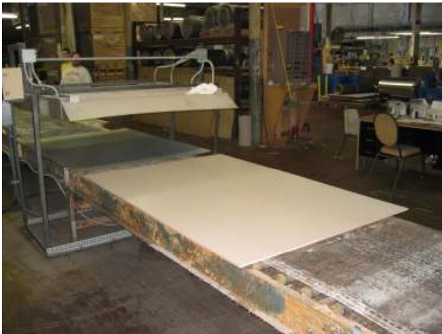
It then is cured using controlled heat