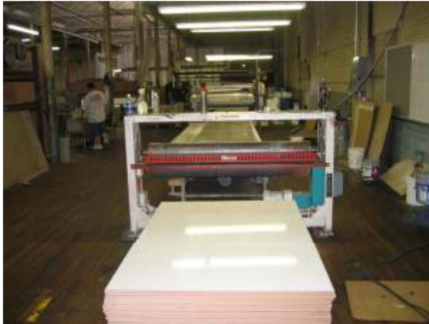
This laminating line is where the steel facing and aluminum backing are laminated to the core.