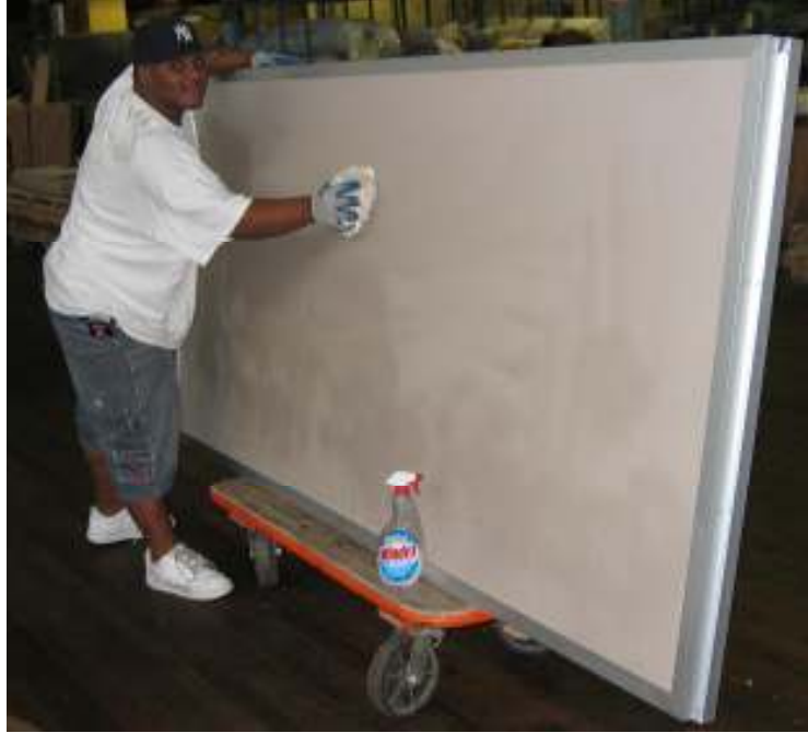
Every board is carefully cleaned before it is shipped. (Shown: J Series Bulletin Board with Forbo Cork)

Manufacturers of Custom Quality Chalk Boards, Marker Boards, Bulletin Boards and Display Cases