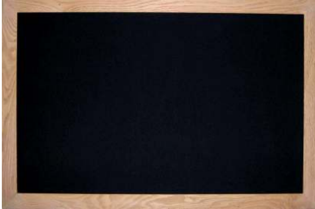
Aywon builds products our customers are proud to own. (Shown: Hardwood Bulletin Board with Forbo Cork)

Manufacturers of Custom Quality Chalk Boards, Marker Boards, Bulletin Boards and Display Cases