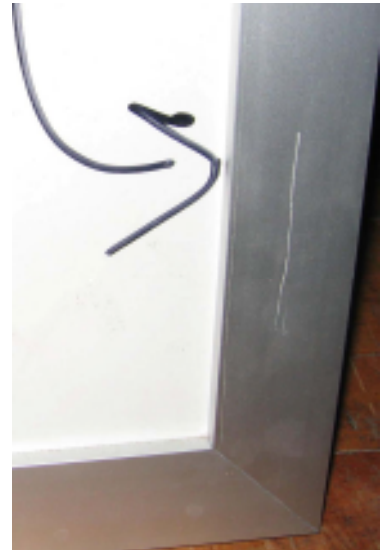
This board was rejected for a scratch that most customers would never notice.