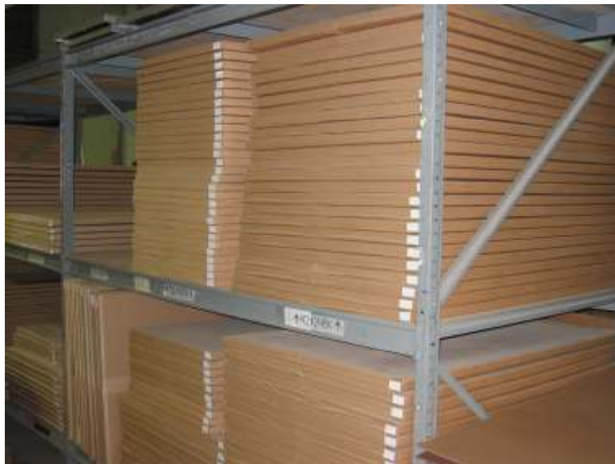
Dozens of products are pre-packed and ready for “quick ship”.