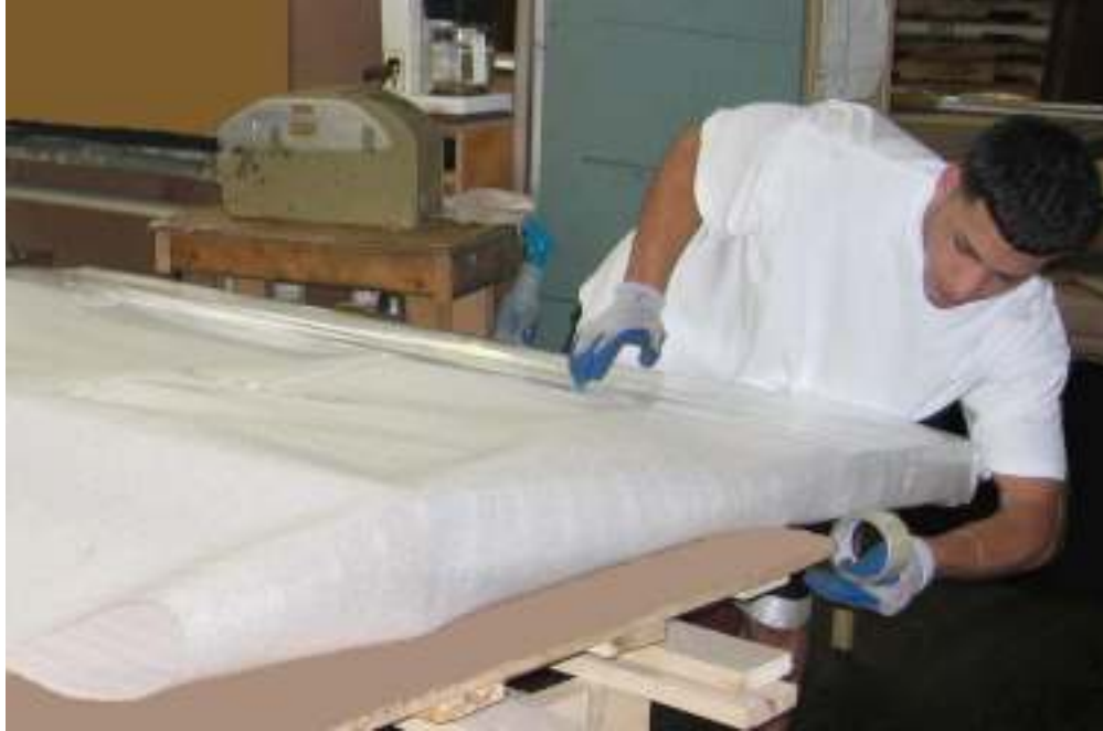
Heavy and/or complicated products get extra packaging (Shown: “Slider” with two movable marker boards.)

Manufacturers of Custom Quality Chalk Boards, Marker Boards, Bulletin Boards and Display Cases