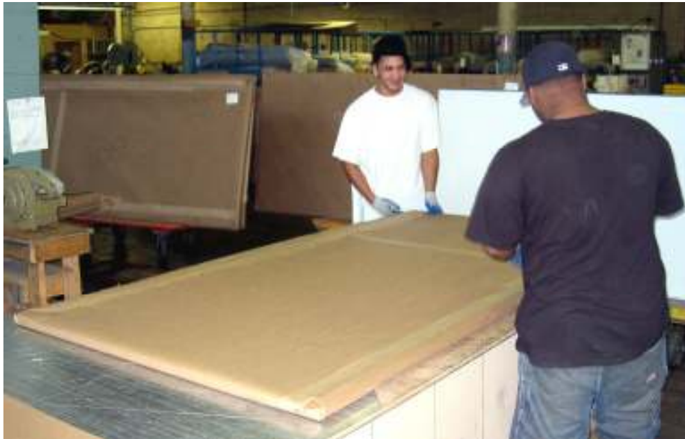
Each product is packed to avoid damage during shipment.