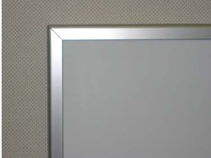
Even our value-priced products are built to tight specifications (Shown: Value Series Marker Board with Silver Frame)

Manufacturers of Custom Quality Chalk Boards, Marker Boards, Bulletin Boards and Display Cases