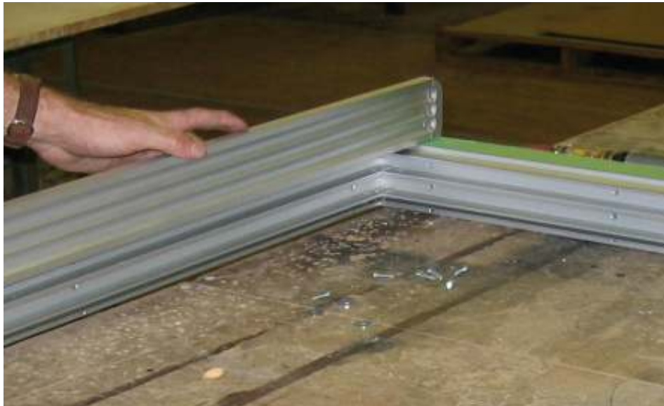
Tape is often applied during assembly to avoid scratches. (Shown: AY 10 chalk tray being installed on a two-board "slider".)