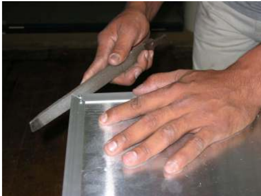
Corners are filed smooth to avoid sharp edges and damaged clothes. (Shown: J Series back panel.)